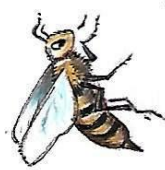
THE 1502 "BOOK OF SIMPLER" RECOMMENDS THE JUICE OF FRESH HONEYSUCKLE LEAVES AS A REMEDY FOR BEE STINGS.