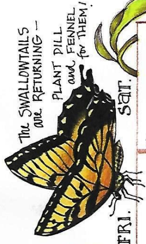
THE SWALLOWTAILS ARE RETURNING — PLANT DILL AND FENNEL FOR THEM!