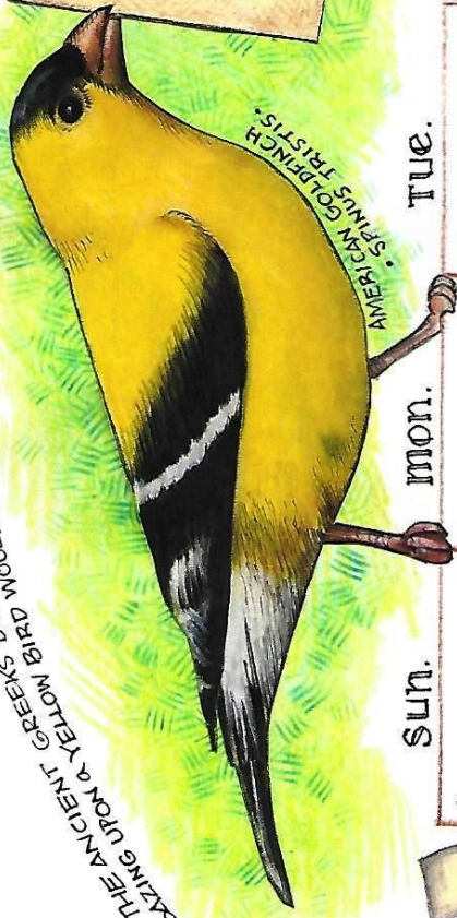
*AMERICAN GOLDFINCH *SPINUS TRISTIS*

THE ANCIENT GREEKS BELIEVED THAT GAZING UPON A YELLOW BIRD WOULD CURE JAUNDICE.